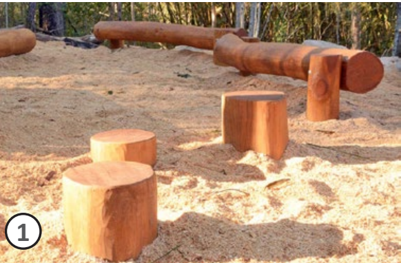
TIMBER STEPPING LOGS