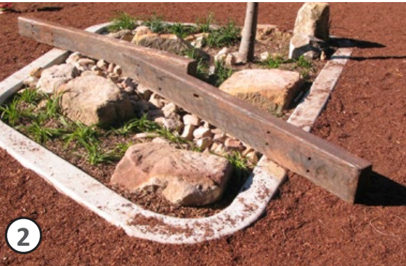
TIMBER BALANCE BEAMS