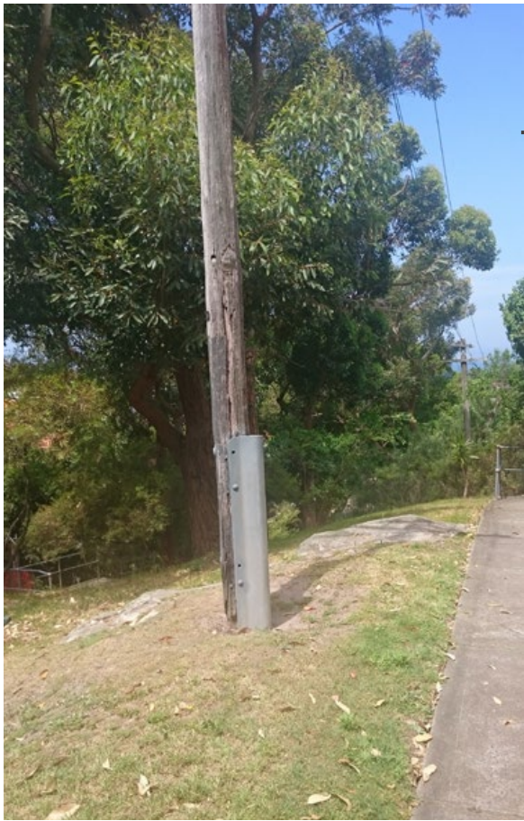
Power poles and overhead powerlines.