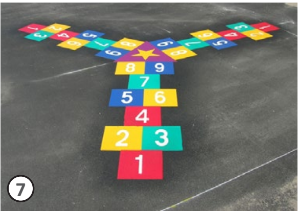
HOPSCOTCH / NUMBERS