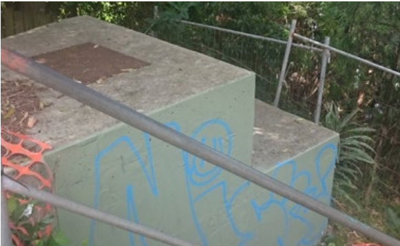
Storm water pit.