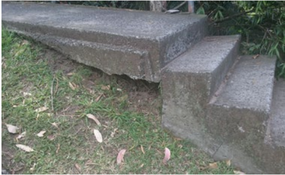
Scoured stair subbase (All stair locations)