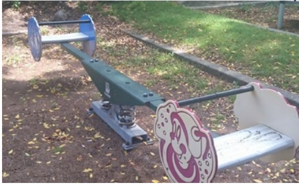
Play equipment- See saw