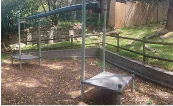
Play equipment - Flying fox