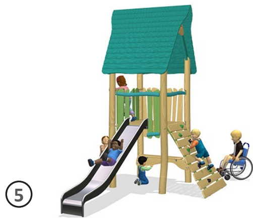
MULTI UNIT TOWER WITH SLIDE