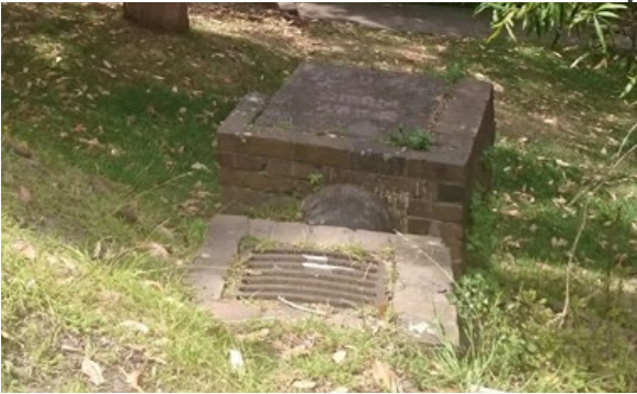
Storm water pit.