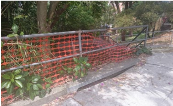
Temporary fencing and webbing.