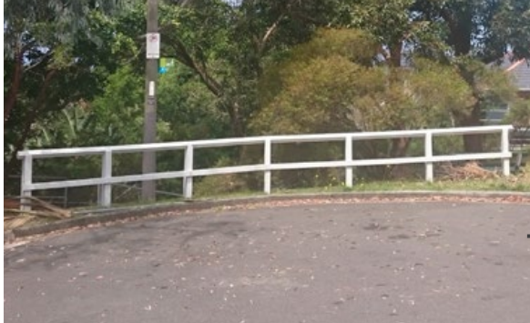
Timber Arris rail fence.