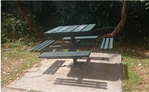
Timber picnic setting.