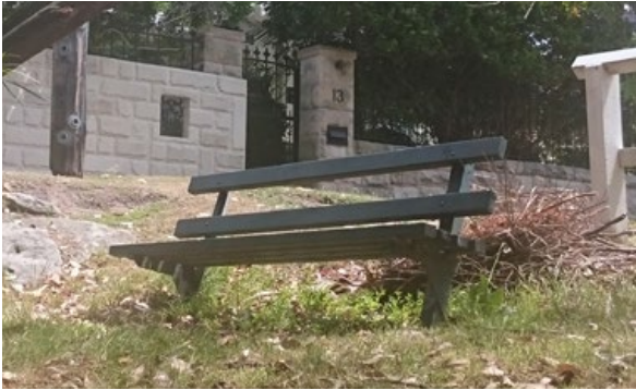
Timber seat with back