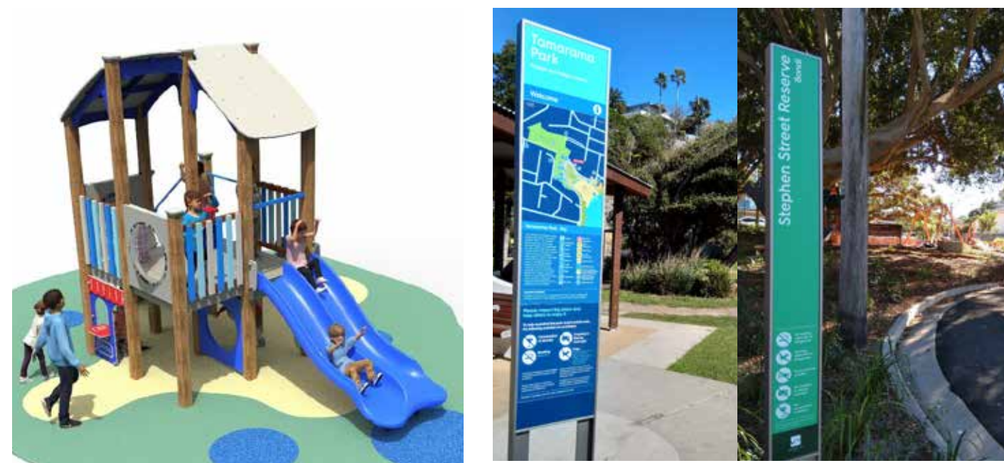
Combination Play Equipment Waverley Council Park Signs