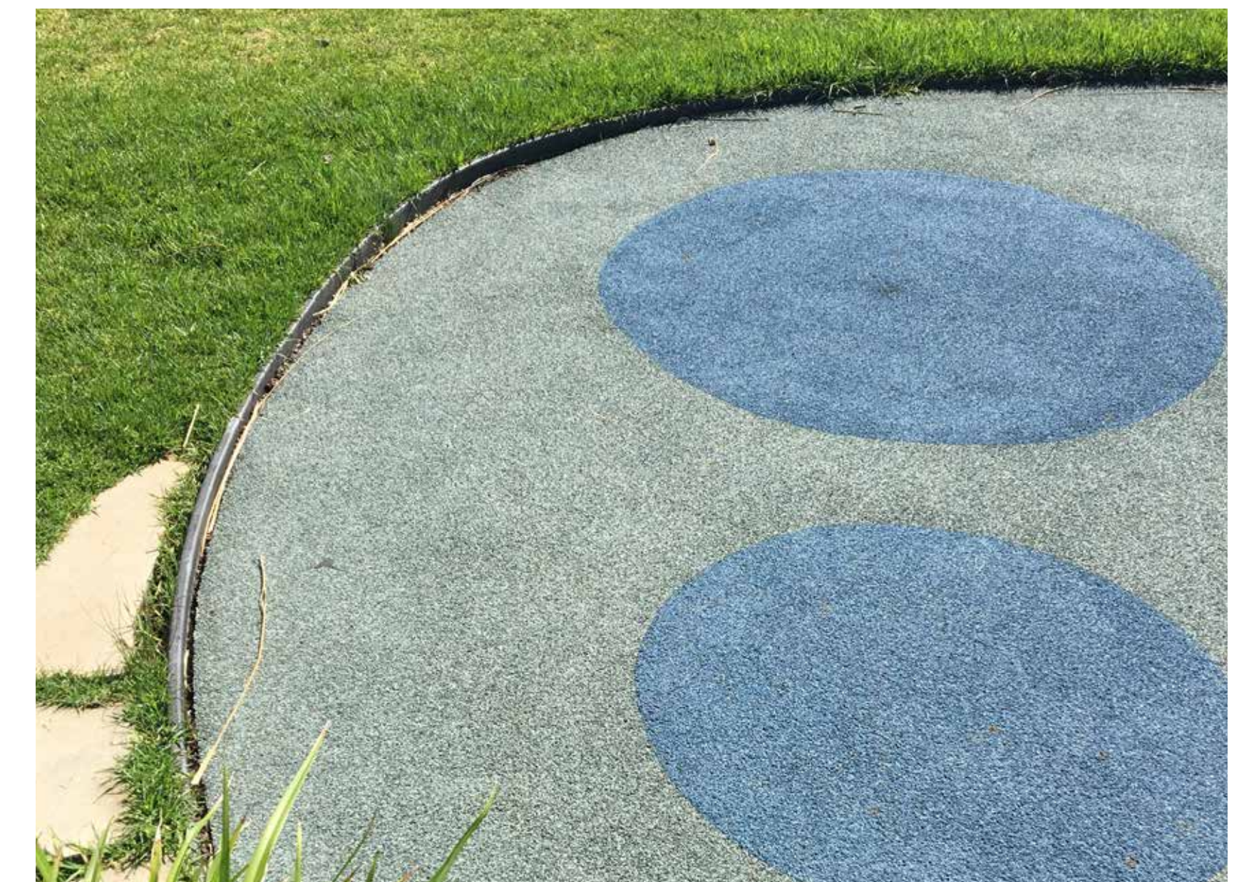
Photo 3: Existing worn rubber soft fall - slumping & separating from edging