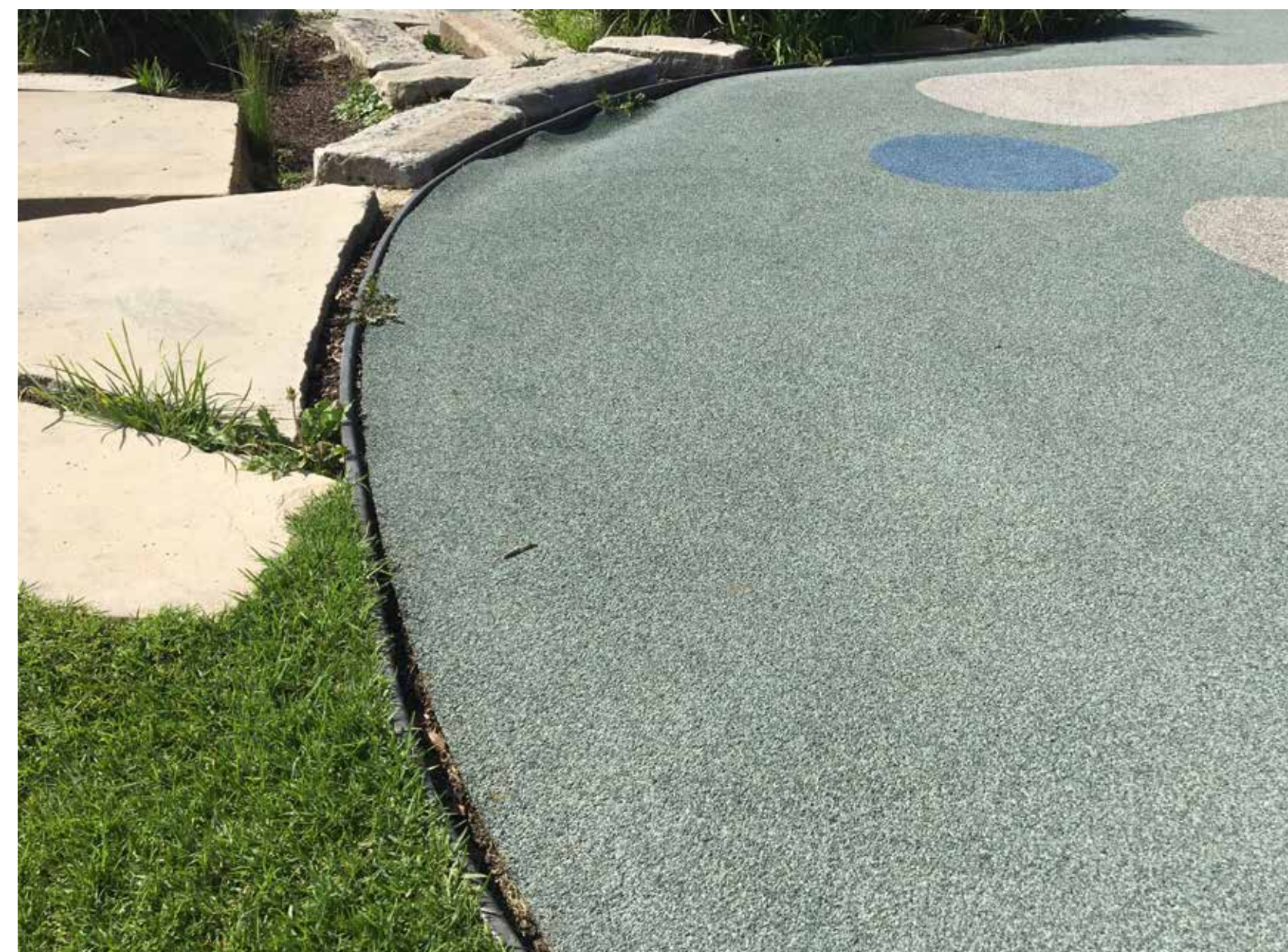
Photo 1: Existing worn rubber soft fall - slumping & separating from edging