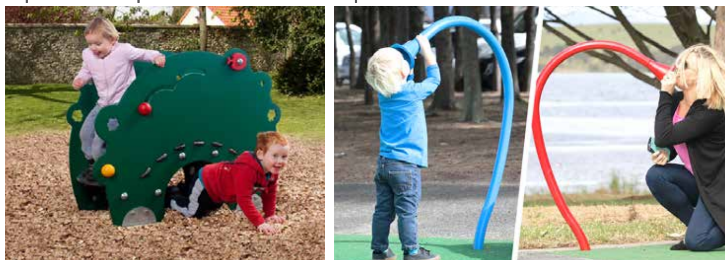
Option 3 - toddler play panel Option 4 - Sensory/ music play