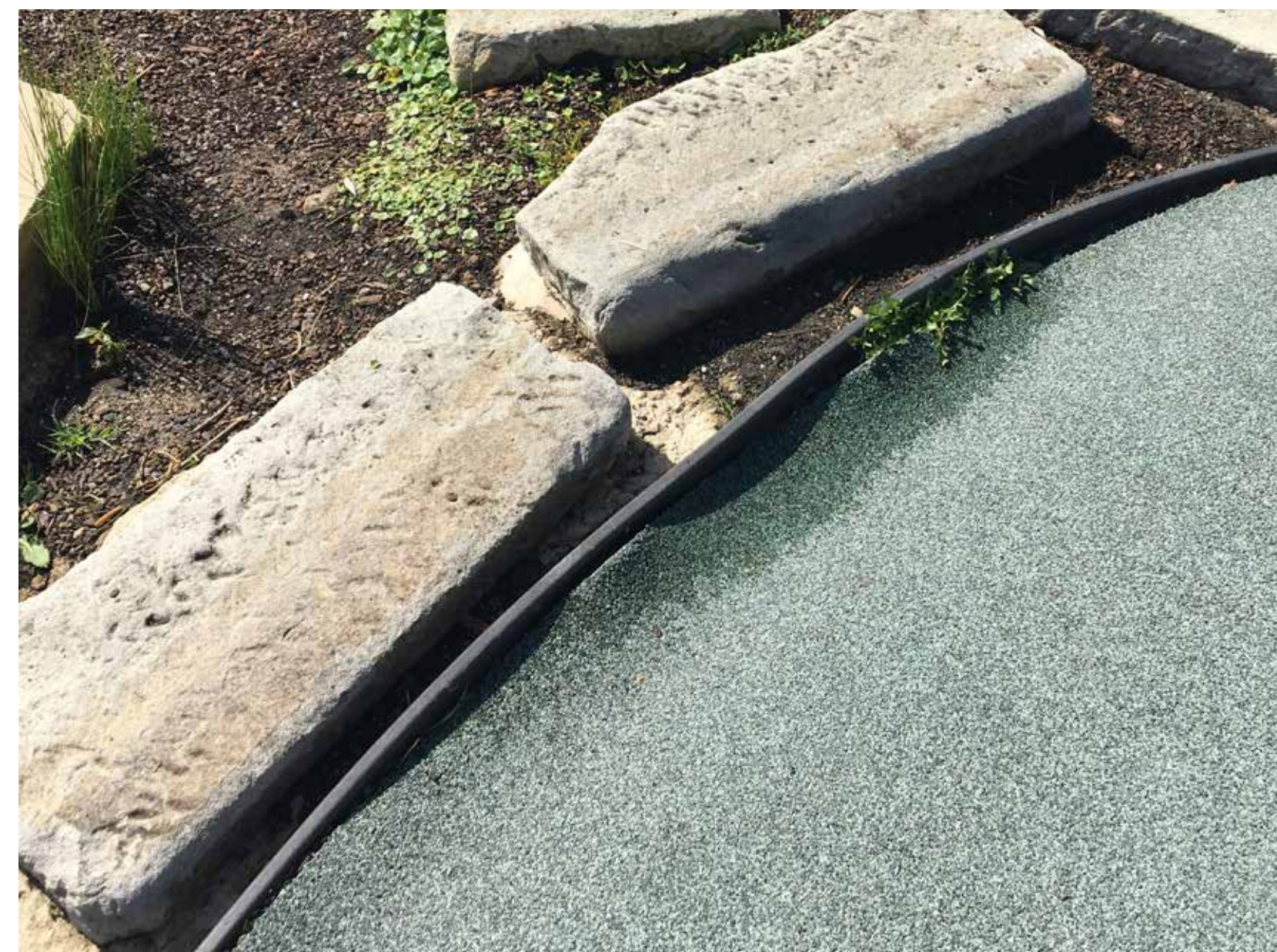
Photo 2: Existing worn rubber soft fall - slumping & separating from edging