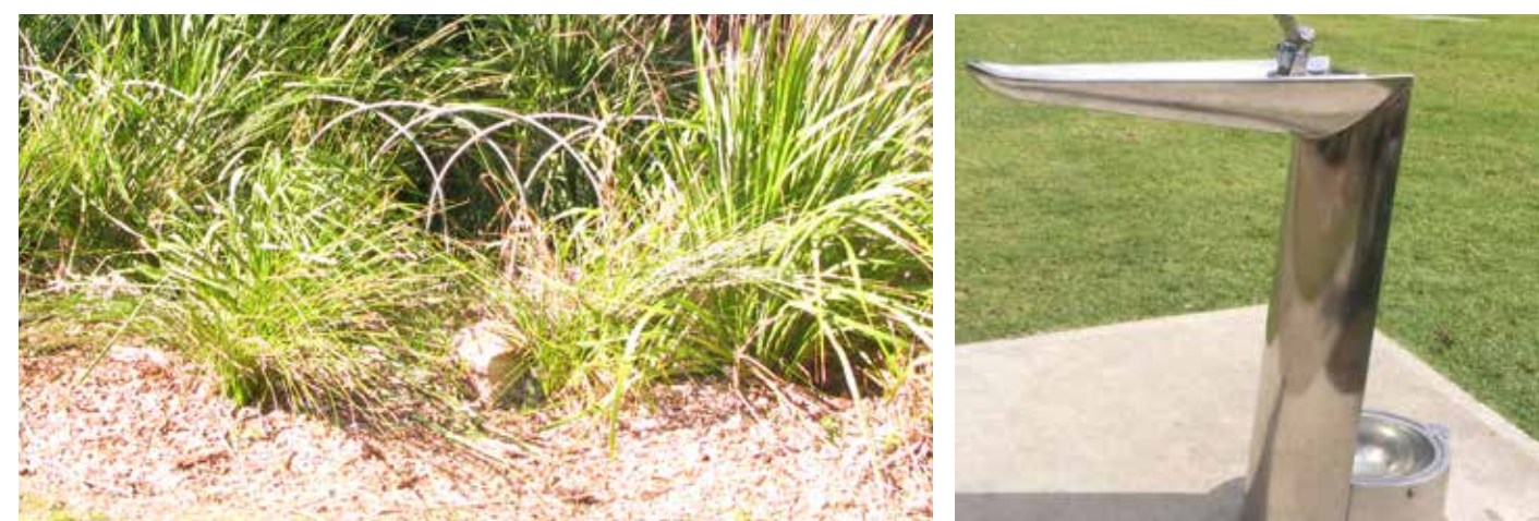
Garden Fence Drinking Fountain