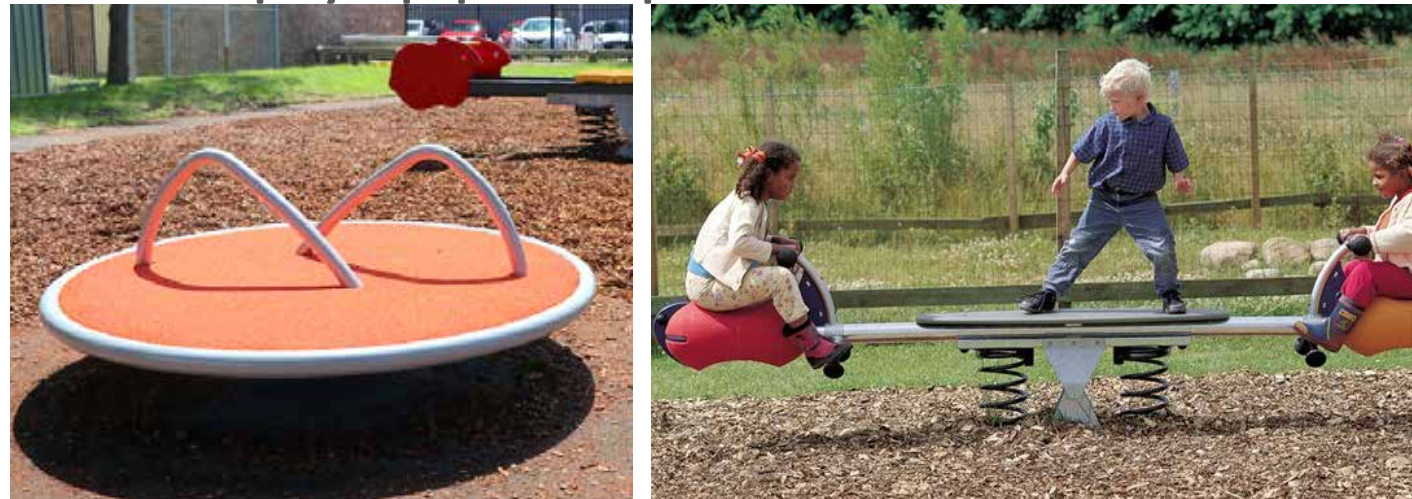
Option 1 - Spinner Option 2 - Seesaw