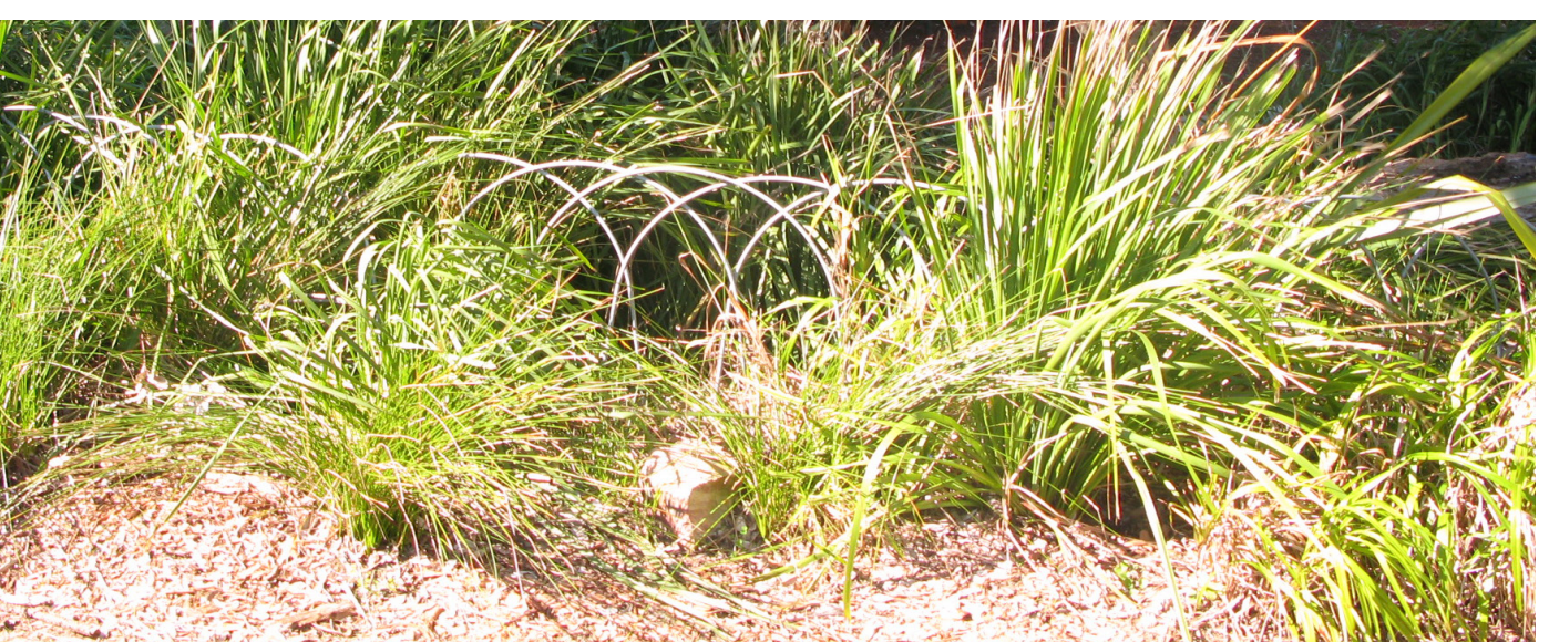
Garden Barrier Fence