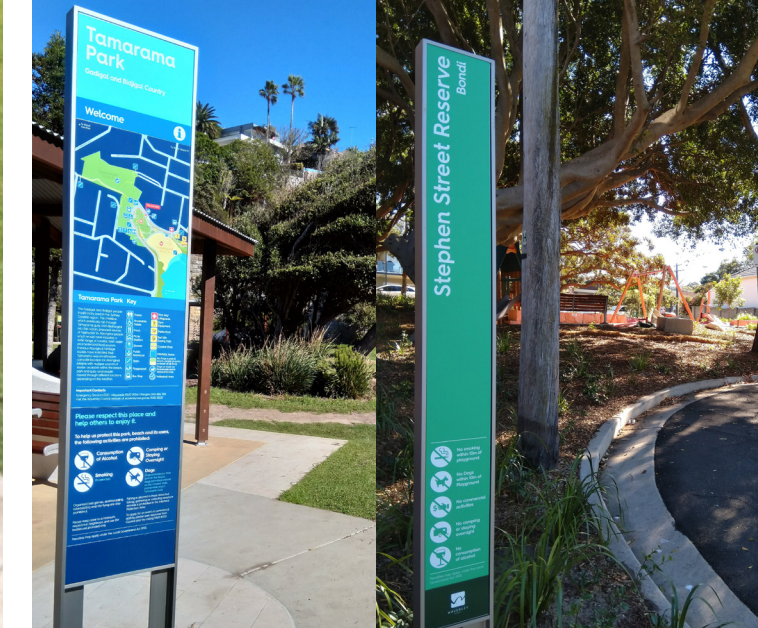
Drinking Fountain Waverley Council Park Signs