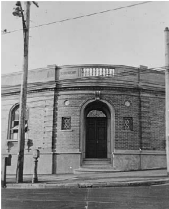
Figure 5 – Waverley Telephone Exchange, 1926 Showing the former entrance on the corner that has since been converted into a window.