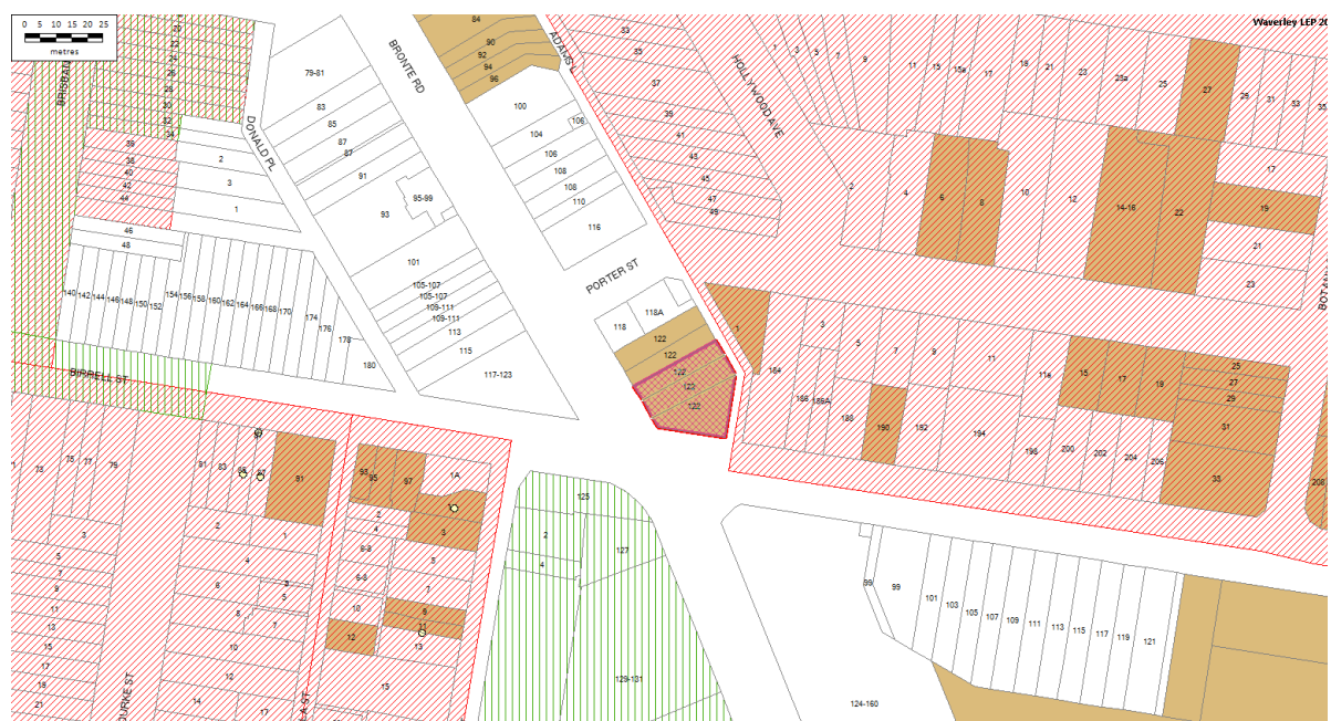
Figure 10 – Excerpt from Heritage Map WLEP2012