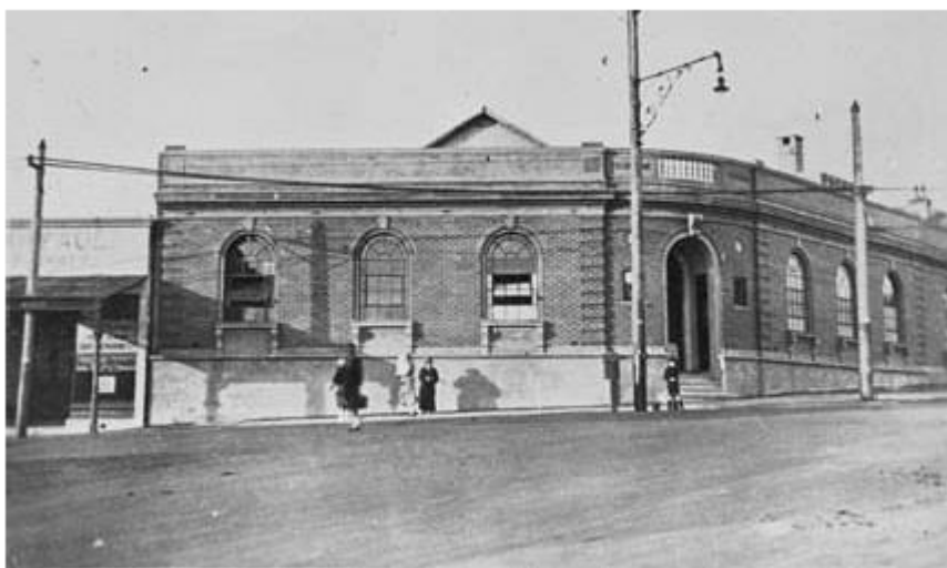
Figure 4 – Waverley Telephone Exchange, 1926