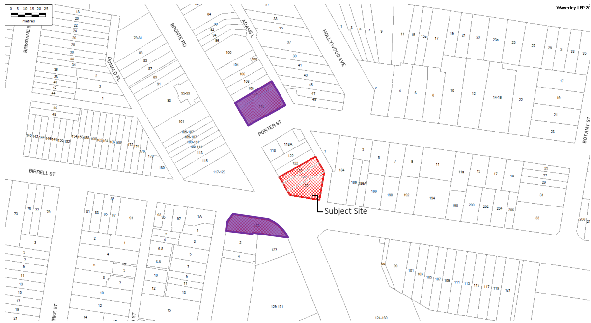
Figure 12 – Nearby Recently Approved Development subject of LEC Appeals (DA-512/2016 and DA-621/2014)

As documented in Table 1, recently approved developments in the area have not significantly varied the existing LEP controls, and have provided a relatively consistent four storey street wall to Bronte Road. The development applications for 125 Bronte Road, and 110-116 Bronte Road were both the subject of Land & Environment Court (LEC) appeals. The determinations for both appeals saw the LEC ensure compatibility with the current street character as well as the desired future street character as set by the WLEP2012 and the WDCP 2012.