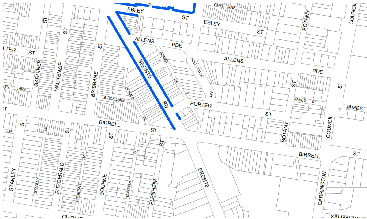
Figure 11 – Excerpt from Active Street Frontages WLEP2012