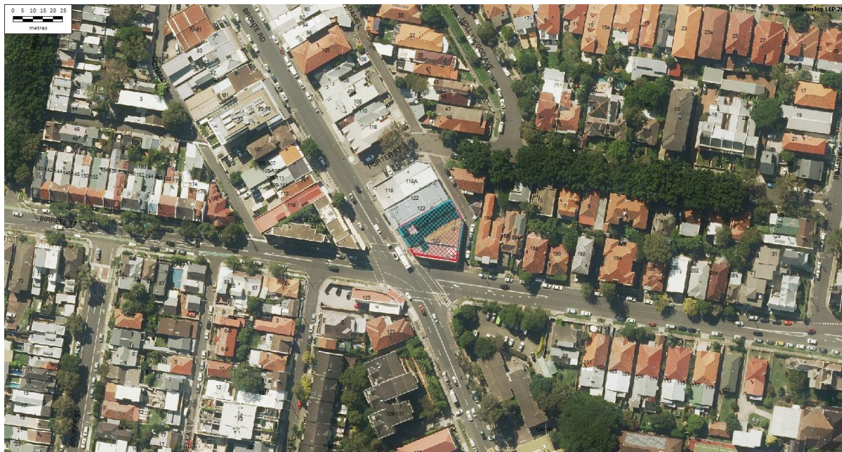
Figure 2 – Aerial photograph of the site of the planning proposal, 122 Bronte Road Bondi Junction (2016).