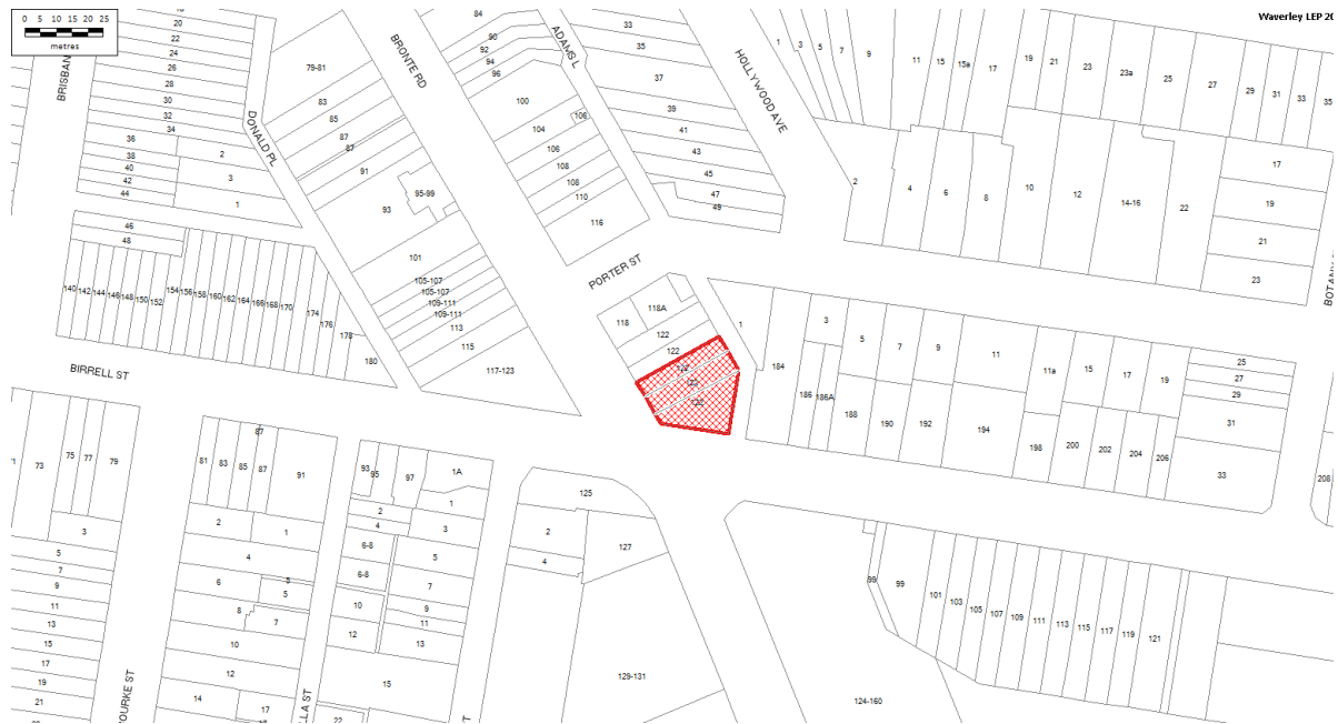
Figure 1 – Site of the Planning Proposal, 122 Bronte Road Bondi Junction

The subject site is a significant corner site located on the edge of the Bondi Junction Strategic Centre at the corner of Birrell Street and Bronte Road, and comprises Lots 5-7 Section 2 DP185 with a total site area of approximately 657.9m 2 . The site forms part of the Waverley Telephone Exchange operated by Telstra, which will continue to function solely in the adjacent site at Lots 3-4 Section 2 DP185. The remaining exchange has a five-storey street wall presence, and is a utilitarian red brick building that is out of character with the remainder of the streetscape (refer to Figure 3).