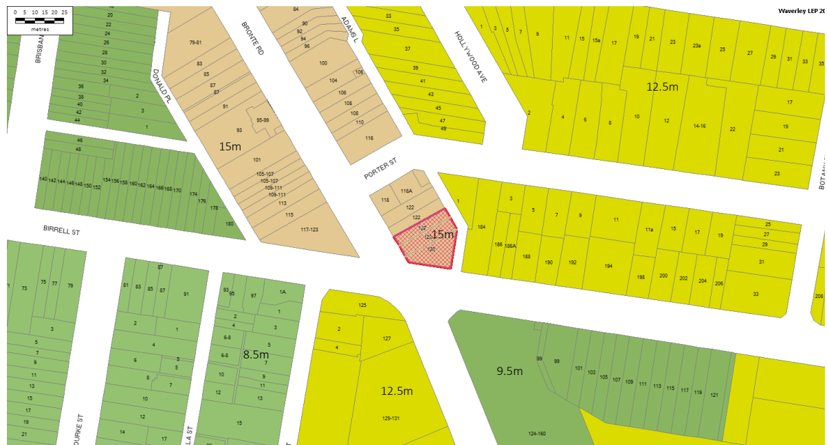
Figure 9 – Excerpt from Height of Buildings Map WLEP2012