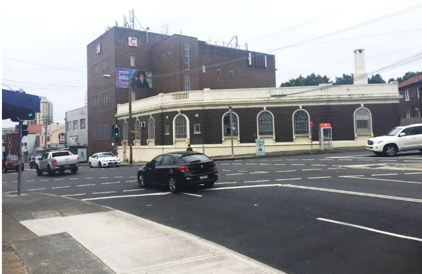
Figure 3 – Subject site showing both Waverley Telephone Exchange Buildings

The site was purchased in 1882 for the construction of the Waverley Post Office, which opened in 1887. The post office was moved in 1914, and the building was adapted to house the area's first telephone exchange. The building underwent major alterations in 1926 when the exchange was converted from manual to automatic. Given further technological advances in telecommunications, the site is no longer required for the purposes of a telephone exchange as the operations will be consolidated into the adjoining building at Lots 3-4 Section 2 DP185.