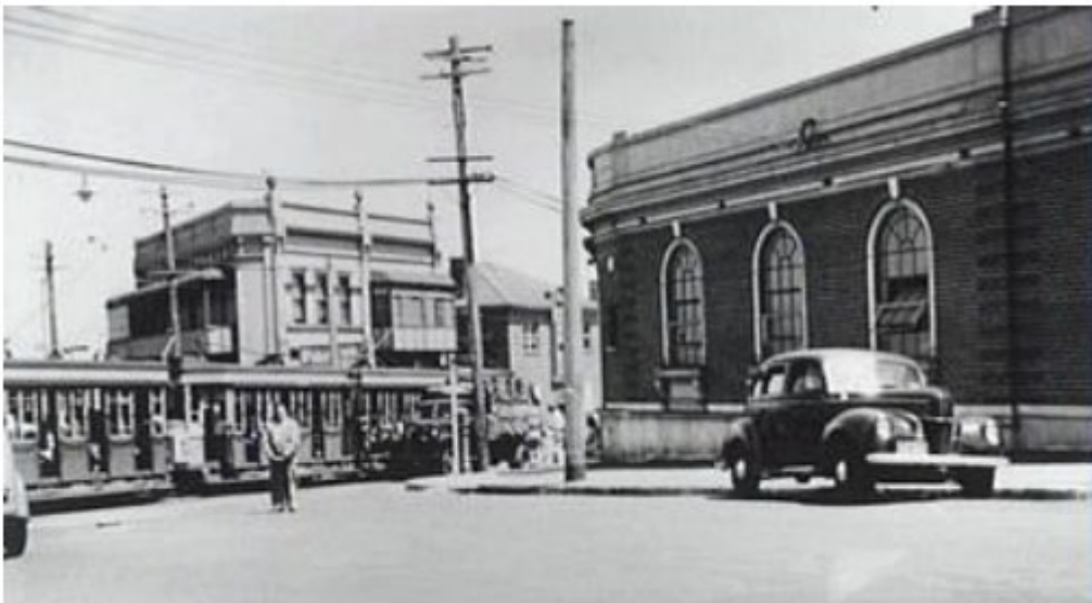
Figure 6 – Waverley Telephone Exchange, 1946