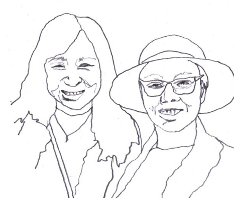
Ahlen & Jeung

The existing building is fine for what it is. We don't need the Taj Mahal!