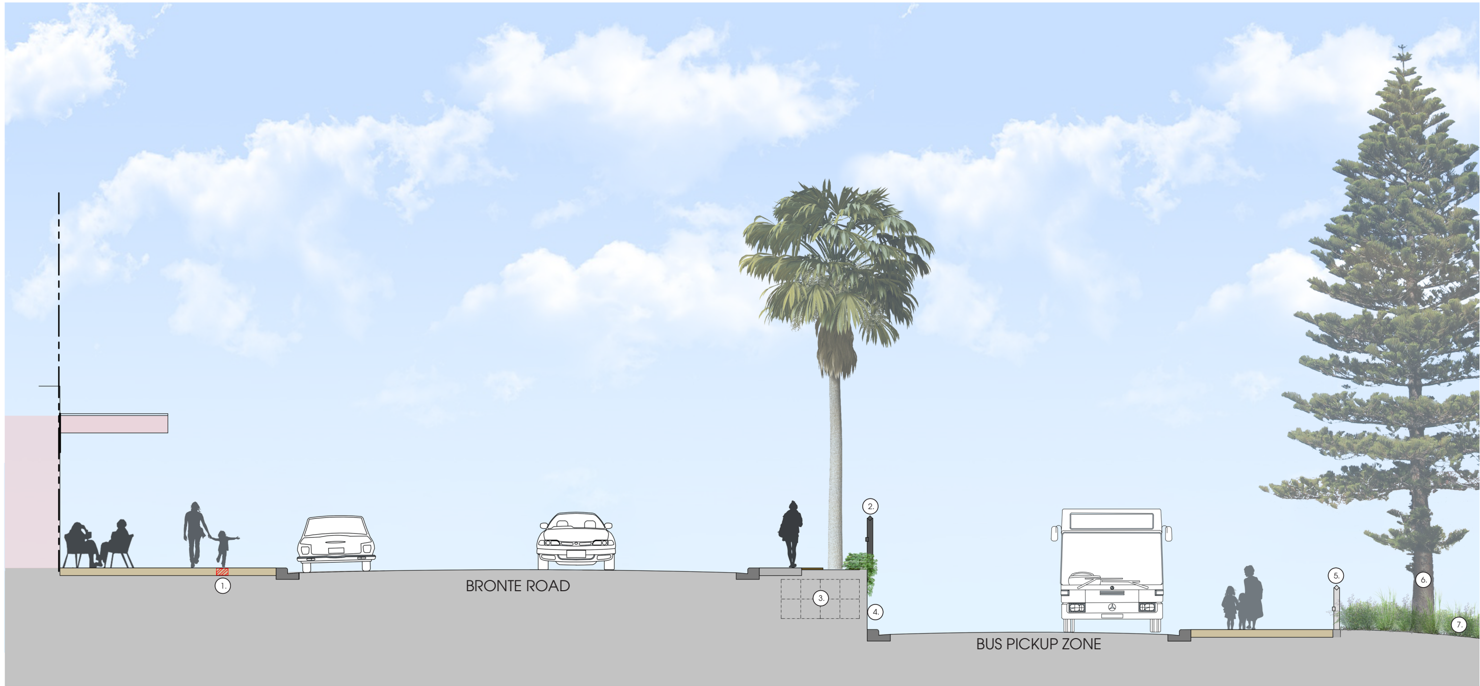
ELEVATION FROM BRONTE RD TO BRONTE PARK - SECTION 1:50