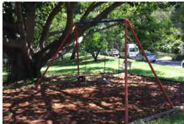
② Existing double seat swing set