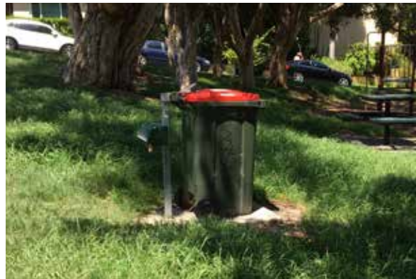
③ Existing bin