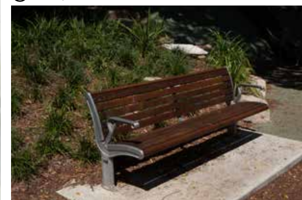
⑨ New seat