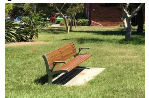
⑥ Existing seat