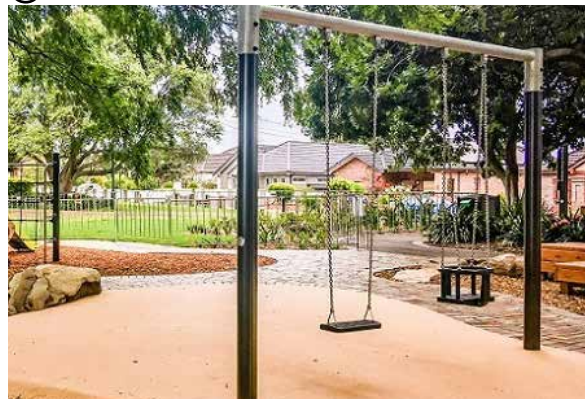
② New double seat swing set