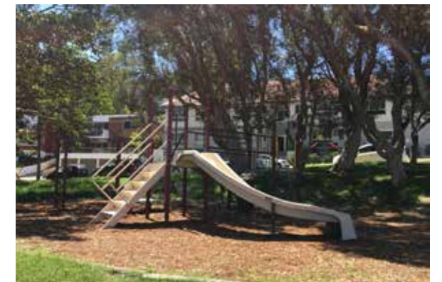
⑤ Existing play equipment