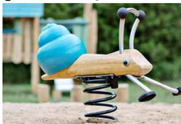
③ New springer play element