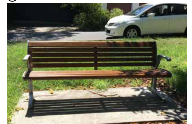
⑧ Existing seat