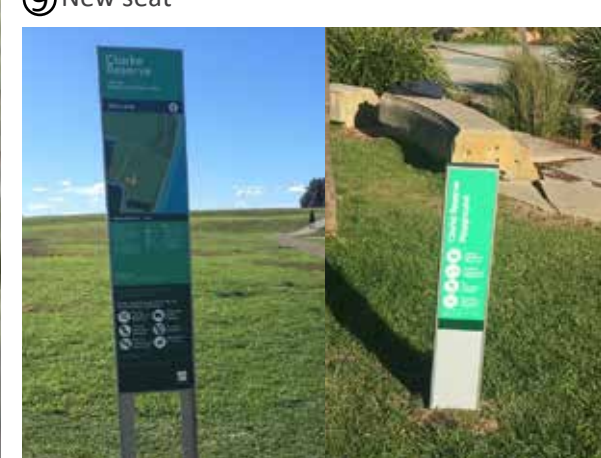
⑩ Park signs