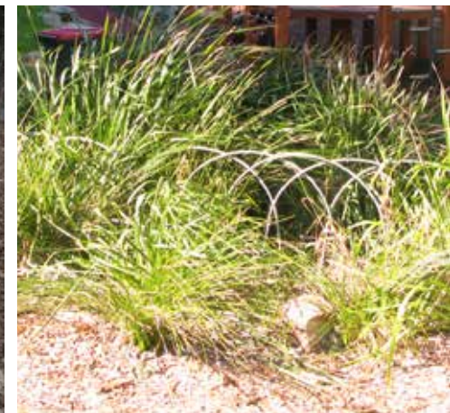
⑦ Low garden hoop fence