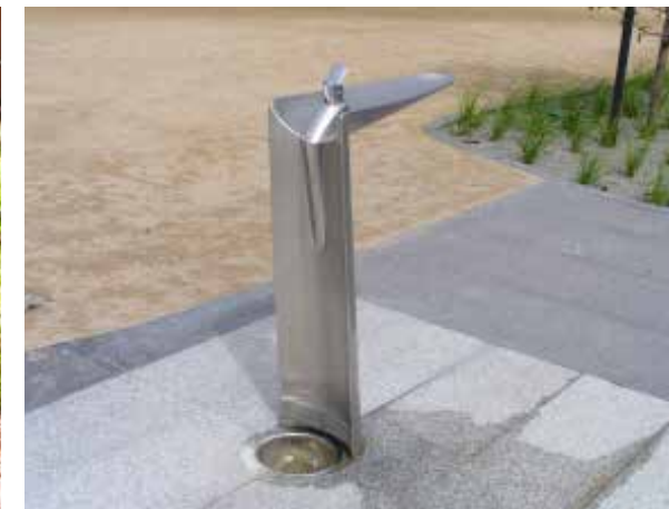
⑪ New drinking fountain