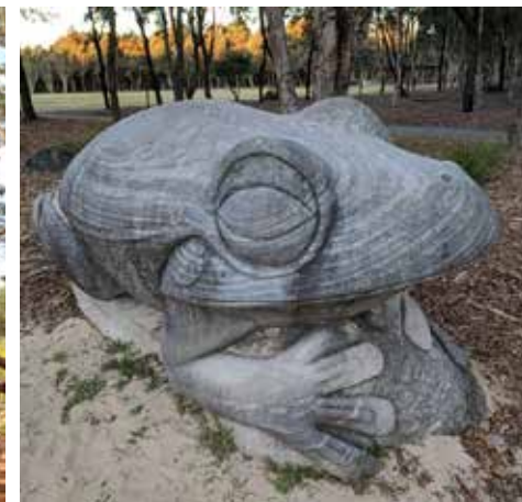
⑥ Sculptural play elements