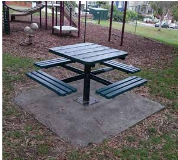
④ Existing picnic table