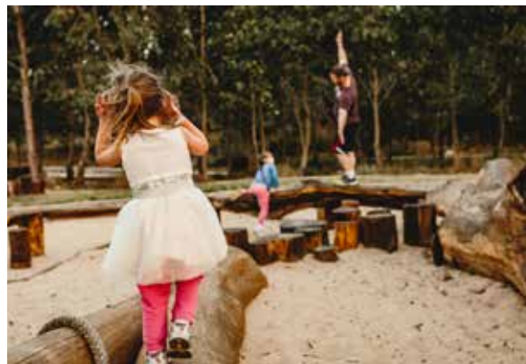
① Nature play elements