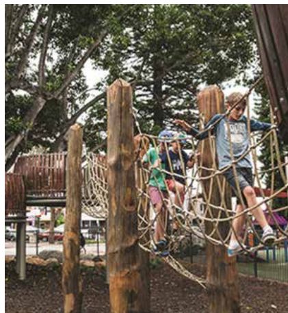
⑤ New timber multi-play unit