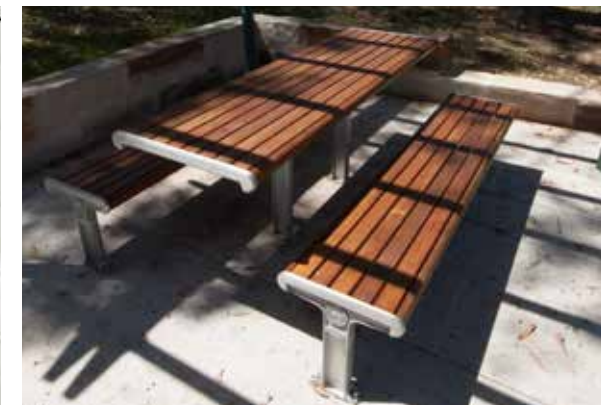
⑧ New picnic table