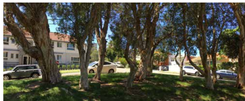
⑨ Grove of existing Melaleuca (Paperbark) trees