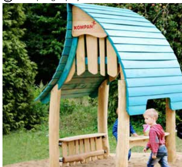
④ Cubby house