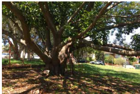
① Existing Ficus elastica (Rubber Fig) Tree