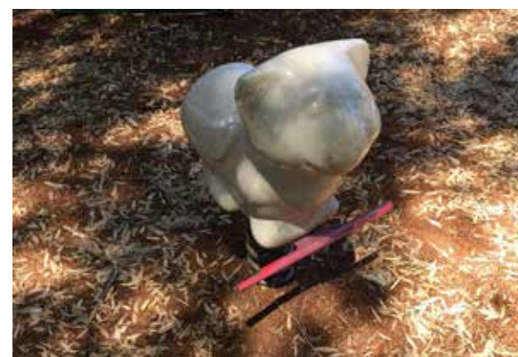
⑩ Existing springer