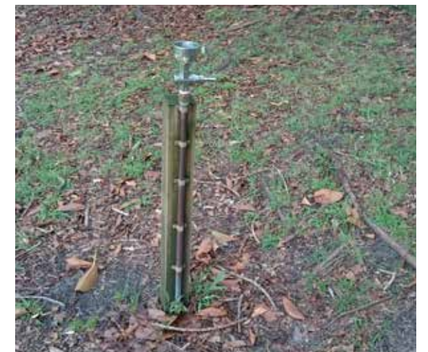
⑦ Existing drinking fountain