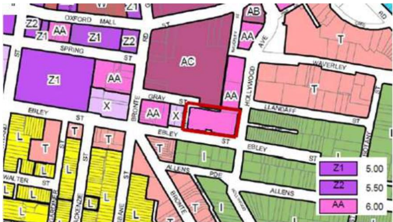
Proposed floorspace ratio on the site