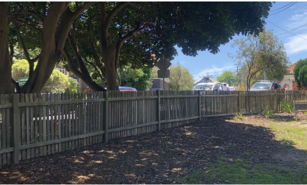
EXISTING TIMBER FENCE AND TREES BEHIND