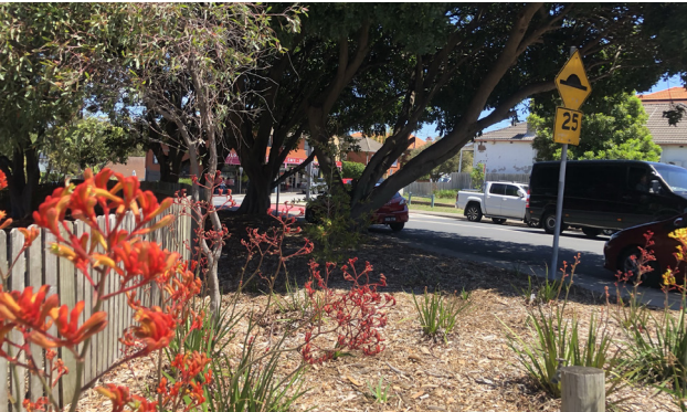
EXISTING PLANTING AND TREES ALONG MURRAY STREET