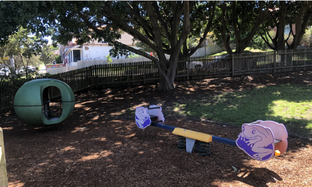
EXISTING PLAY EQUIPMENT