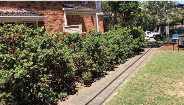
EXISTING PATH AND PLANTING

Project Title: BELGRAVE STREET RESERVE UPGRADE