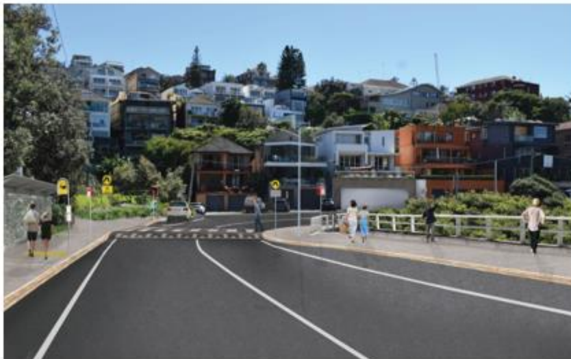
Render 1. Raised pedestrian crossing

Waverley Council PO Box 9, Bondi Junction NSW 1355 DX 12006, Bondi Junction Customer Service Centre 55 Spring Street, Bondi Junction NSW 2022 ABN: 12 502 583 608