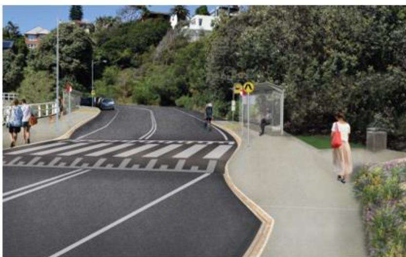
Render 2. Raised pedestrian crossing and upgraded bus shelters

Contact us 9083 8000 info@waverley.nsw.gov.au waverley.nsw.gov.au