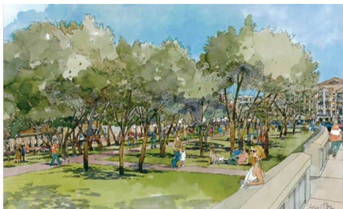
An artist's impression of the green roof over the underground car park.

In the Interim Plan, Council's Parks Yard remains in its current location (at the back of the Surf Club) and is upgraded to accommodate the beach rake and improved staff amenities. The building provides a small footprint, limited approximately to that of the present Parks Yard.