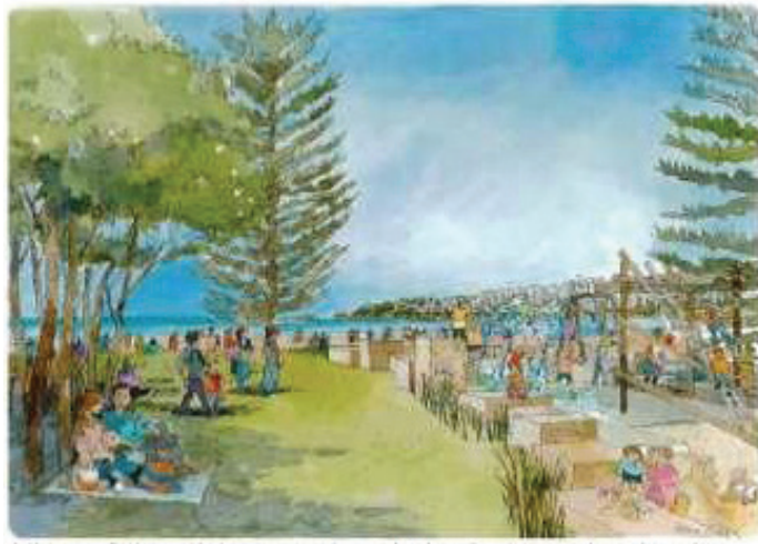
View of the playground and shade tree planting in the park