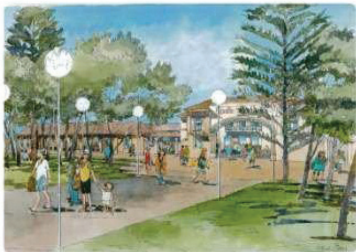
Bondi Pavilion (rear)