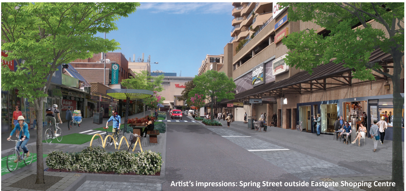
Artist's impressions: Spring Street outside Eastgate Shopping Centre