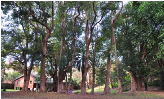
Trees to be removed based on arborist review and replaced with indigenous species