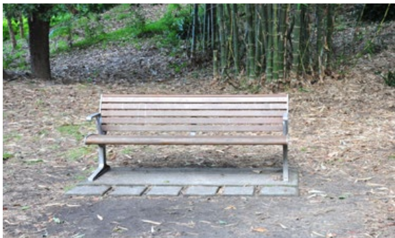
Seat to be reused