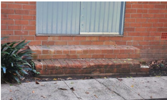
Existing main entrance to hall to be upgraded for universal access