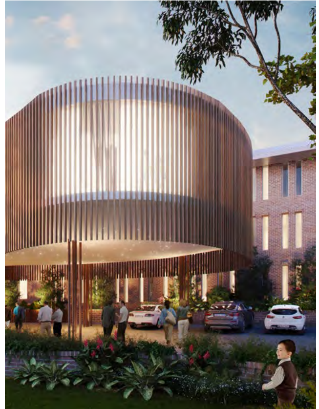
Indicative view of proposed exterior from Napier St (photomontage)