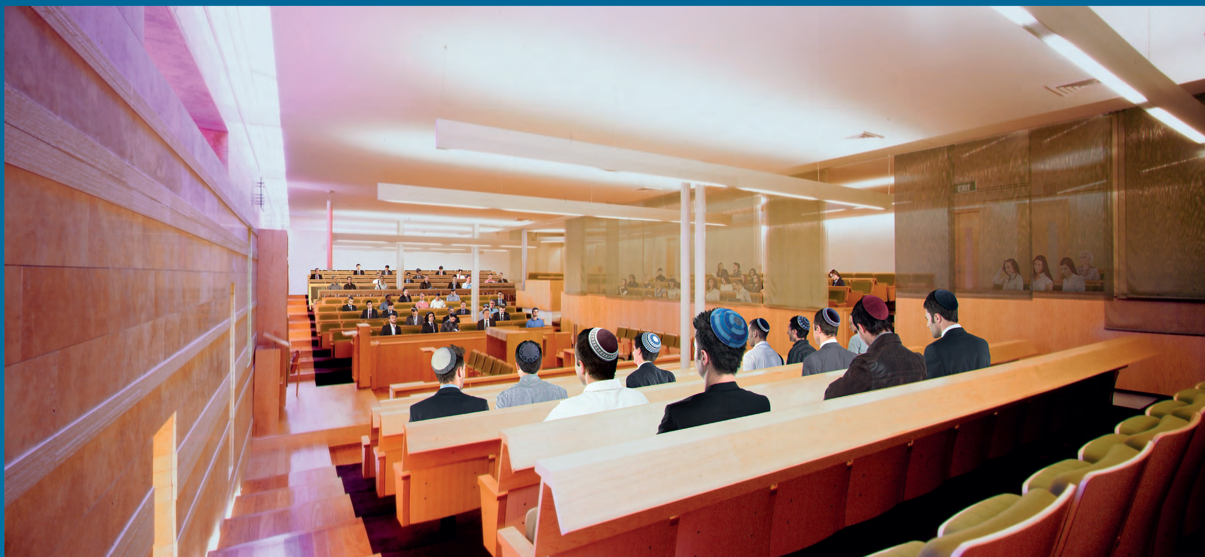
Indicative view of proposed interior (photomontage)

To find out more about the project or provide your feedback, contact Urbis Social Planning on: Telephone: 1800 244 863 | E-mail: DoverHeightsShule@urbis.com.au